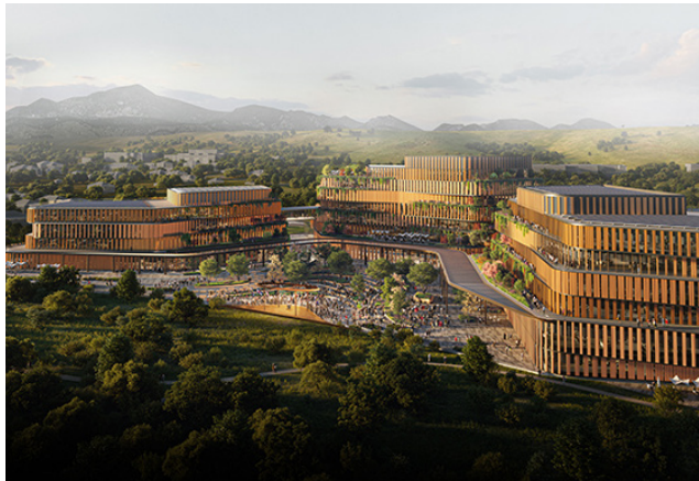
GLOBAL ENERGY PARK