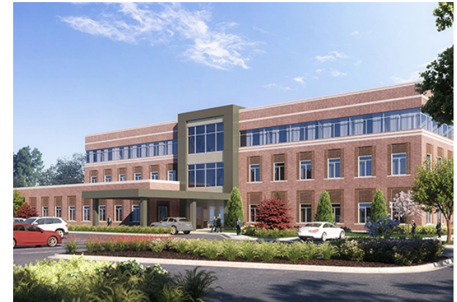
WESTFIELD MOB AND ASC